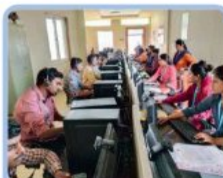
Online drive of students