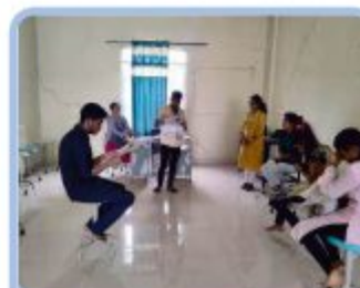
Group Discussion Activities