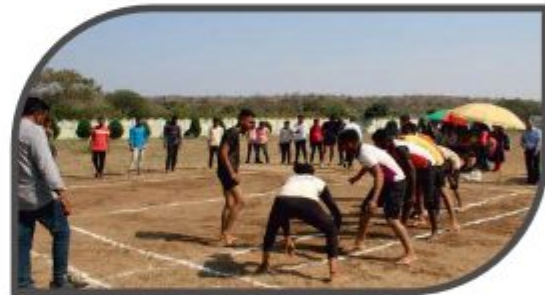
Indoor & Outdoor Sport Facilities