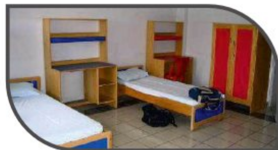
Separate Hostel for Boys & Girl