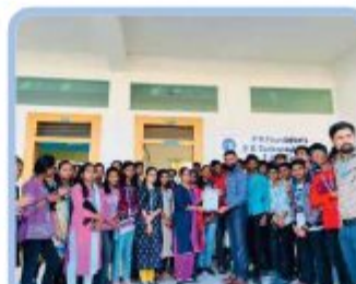
Certification for Trainings