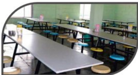
Canteen & Cafe