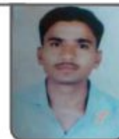
Appa Masal (Sumera Food Ltd)