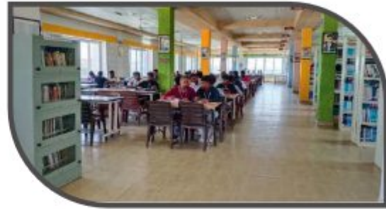
Library, Digital Lab & Reading Hall