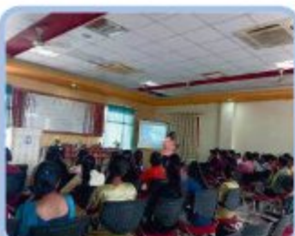
Technical training program